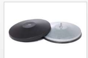
Concrete filled galvanized steel base