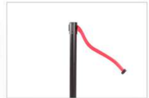
Brake for slow and safe belt retraction