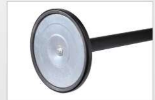
Full circumference floor protector