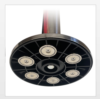
6 x 30mm magnets

The QueuePro Magnetic is supplied complete with the Base Plate and can be fitted with an optional magnetic belt end.