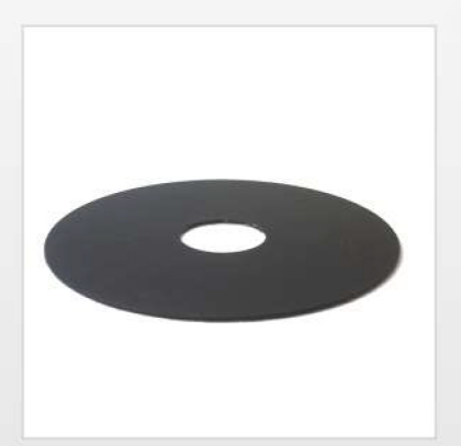
Self adhesive steel base plate