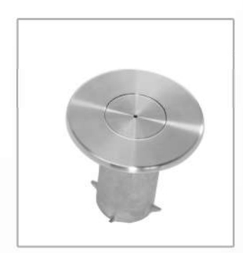
Cap fits into the socket when post is removed.