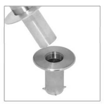
Removable mounting fits a floor socket.

The removable base is designed for permanent queue layouts but where occasional removal of the stanchions is necessary. The Removable Base is a 2" diameter insert fixed to the bottom of the stanchion that slides into a socket set in the floor. A cap fits into the socket when the stanchion is removed.