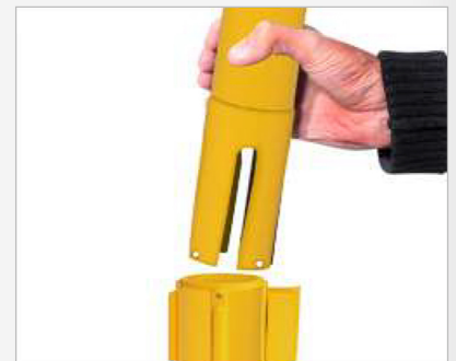
Easy lower cassette replacement