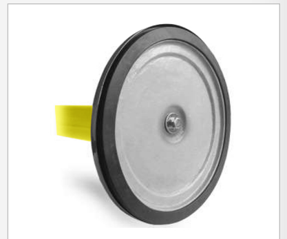
Weatherized cast iron base