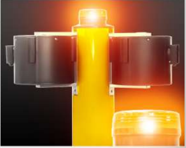
Flashing light option for low light visibility.