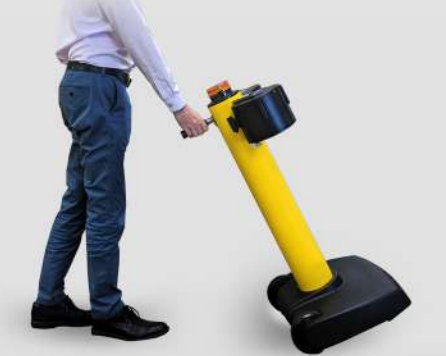
Easy to move and set up