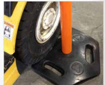
Tough recycled rubber base