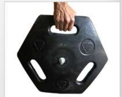
Convenient carry handle