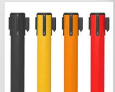
Available in black, yellow, orange, and red.