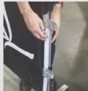
Full velcro side flaps.