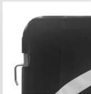
Rounded top corners.