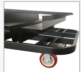
Low lift loading