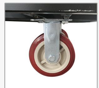
6" locking wheels for excellent stability